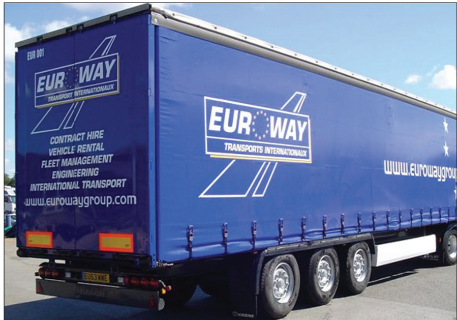
Specialist support services to the road transport industry

Another issue was the need for detailed supporting information regarding the make-up of the gross pay. On the monthly payrolls this meant that four weeks worth of detail about shifts